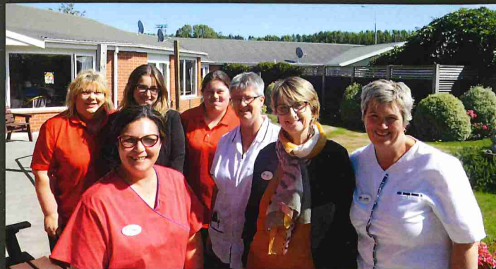
Some of the McKenzie HealthCare team

McKenzie HealthCare is certified by the Ministry of Health to provide hospital, rest home and dementia level care services, including palliative, short stay, convalescent and respite care. Our services include daycare, podiatry, physiotherapy and hairdressing. Policies and procedures meet New Zealand standards, regulations and District Health Board (DHB) contractual obligations. We have a focus on continual improvement and regular internal and external audits ensure we meet high standards.